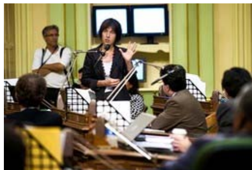
California Assembly Democrats

State authorities fume at Amazon's ability to elude their taxing powers, which are limited across state lines. Amazon Chief Executive Jeff Bezos has said the issue was forefront in his mind when he created the company.